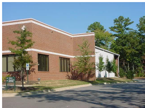
50% of Depth of Façade